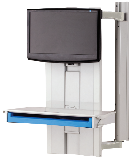
Premium Tandem Arm