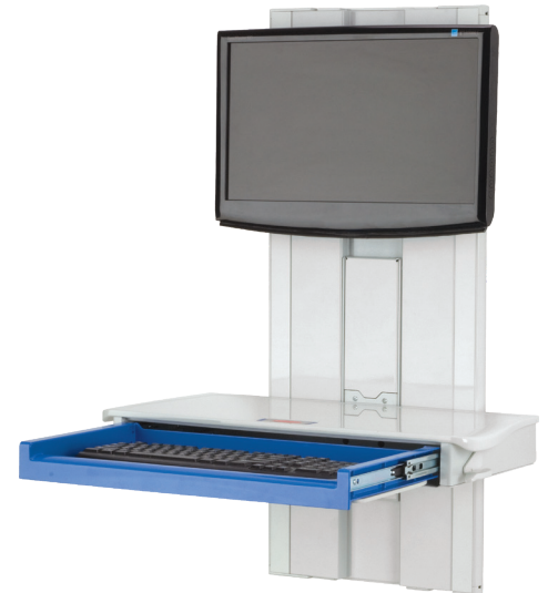
Premium Slim Line